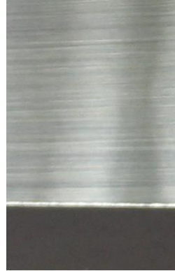
#8.2 Brushed h.g. Chrome