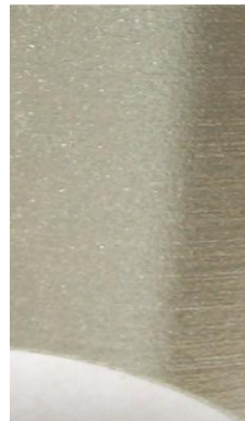
Shiny Nickel plating on SLS