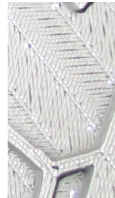
Technical plating on FDM (rough)