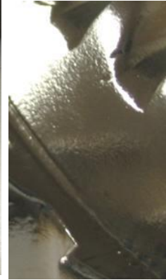
#2.4 Shiny Nickel