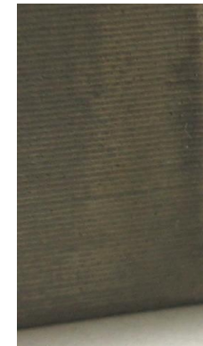
Technical plating on FDM (fine tip)