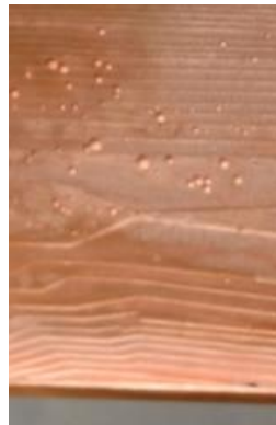
Technical Copper plating on unfinished/rough SLA

EXAMPLES for technical plating on structural RP parts: