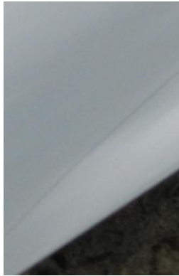
#8.1 High gloss Chrome

EXAMPLES for decorative surface options: