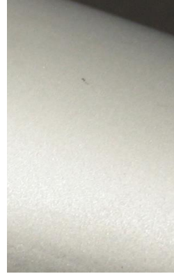
#8.3 Satin Chrome