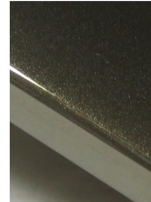
#6.5 Pearlescent (Black)

*Every imperfection in the RP part, casting or machined parts will be visible / magnified by the metal layer.